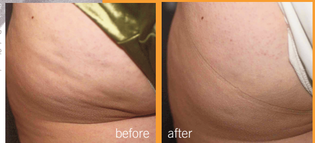
Excellent results 1 month after 8 treatments